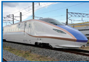
Hokuriku Shinkansen "KAGAYAKI" etc.

Hokuriku Shinkansen (450.5 km) Train Names: KAGAYAKI, HAKUTAKA, TSURUGI, ASAMA