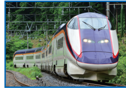
Yamagata Shinkansen "TSUBASA" Yamagata Shinkansen (421.4 km) Train Name: TSUBASA