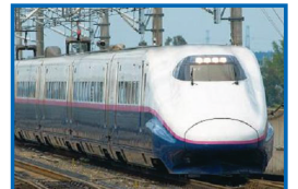
Tōhoku Shinkansen "HAYATE," "YAMABIKO," etc.

Tōhoku Shinkansen (713.7 km) Train Names: HAYABUSA, HAYATE, YAMABIKO, NASUNO