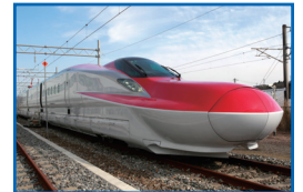
Akita Shinkansen "KOMACHI" Akita Shinkansen (662.6 km) Train Name: KOMACHI

Jōetsu Shinkansen (333.9 km) Train Names: TOKI, TANIGAWA Max-TOKI, Max-TANIGAWA