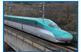
Tōhoku Shinkansen "HAYABUSA" etc.

Tōkaidō & Sanyō Shinkansen "HIKARI" Tōkaidō Shinkansen (552.6 km) Train Names: NOZOMI*, HIKARI, KODAMA