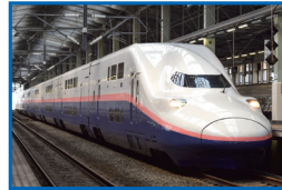
Jōetsu Shinkansen "Max-TOKI" etc.

Jōetsu Shinkansen (333.9 km) Train Names: TOKI, TANIGAWA Max-TOKI, Max-TANIGAWA